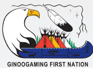
GINOOGAMING FIRST NATION

Eabametoong First Nation (also known as Fort Hope) is located on the shores of Eabamet Lake in the Albany River system. The community location is approximately 240 kilometres north of Beardmore and is accessible by airplane, water or winter/ice roads.