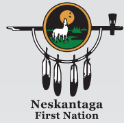
Neskantaga First Nation

Neskantaga First Nation is remotely located on Attawapiskat Lake, 280km north of Geraldton, 180km northeast of Pickle Lake, and 271km northeast of Thunder Bay. The First Nation can be accessed fly-in or by winter roads.