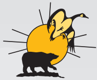
CONSTANCE LAKE FIRST NATION

Aroland First Nation is located 352 kilometers northeast of the City of Thunder Bay and 78 kilometers north of Geraldton. Aroland is located on the Kowkash River 16 kilometers east of the highway and is accessible by road.