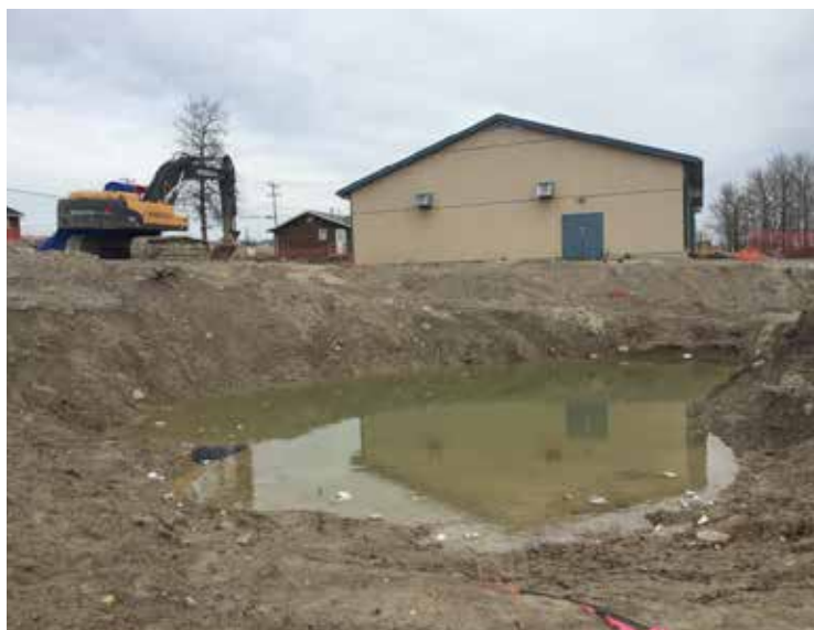
Excavation and de-watering behind teacherages and beside sewage plant