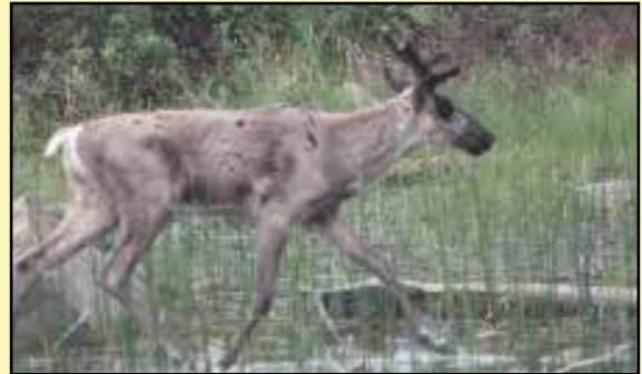
in the Eabamet Lake area

Did you Know: Woodland caribou are found throughout the Matawa member First Nation homelands, including in the 'Ring of Fire' area. Four Rivers, with the support of Environment and Climate Change Canada, will be working with communities over the next few years to start a field research program on our caribou population. One of the tools that community environmental monitors can use when researching caribou populations is a trail camera, which can be set-up to capture pictures of caribou in areas where they are known to travel. The photos help the researcher monitor the population, behaviour and movement patterns of the caribou. For more information, visit fourrivers.group