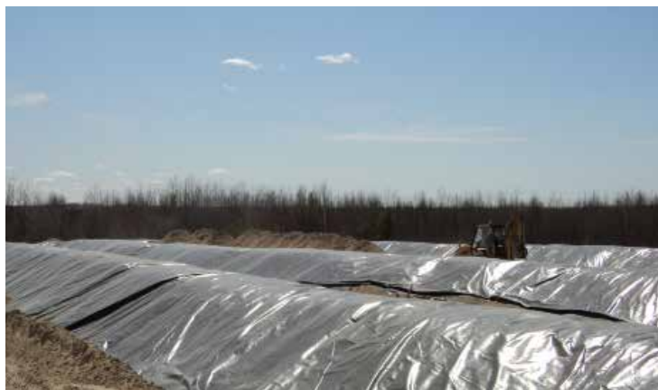
Bioremediation cells being filled with contaminated soil

After a long time waiting, some Matawa communities are seeing fuel contaminated soil cleaned up. Many sites are old power plants, fuel storage areas, building heating tanks, municipal garages, Indian agent residences, and old schools. The following are projects that are currently in the completed, treatment or construction phases.