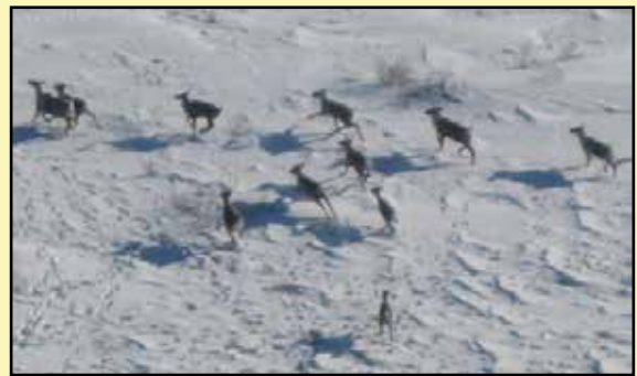
Photo taken by Sarah Cockerton (via helicopter) north of McFaulds Lake

Woodland Caribou are the largest caribou found in Canada. In the winter they eat mainly lichen, which they are able to sniff out using their great sense of smell. In the summer they eat moss, plants, grass, and willow leaves. Woodland caribou need large areas of undisturbed old-growth forests and wetlands, where they can easily find food and hide from predators. As industrial development pushes further north in Canada, woodland caribou are running out of suitable woodlands. This is why the woodland caribou's boreal population here in Ontario is listed as 'threatened', meaning that they may become extinct if efforts are not made to help the caribou and protect their habitat.