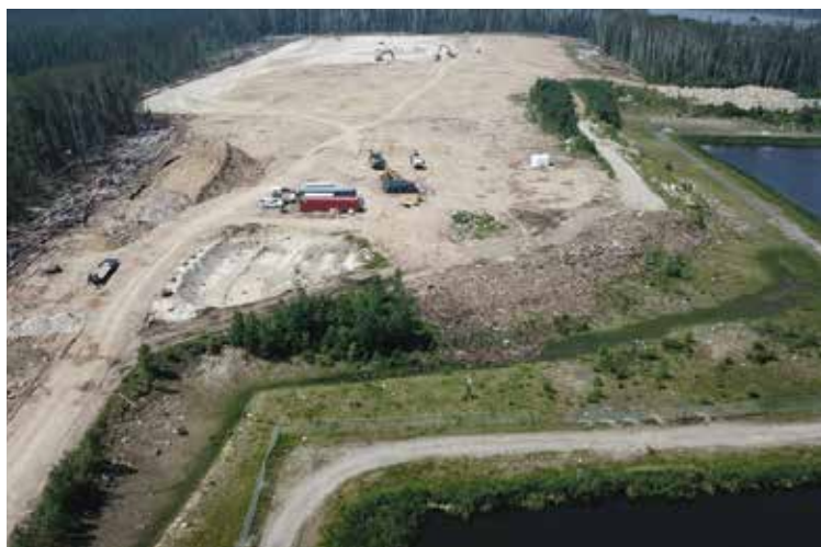
Landfarm (biocell) area by the sewage lagoons