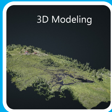
High Quality Imagery