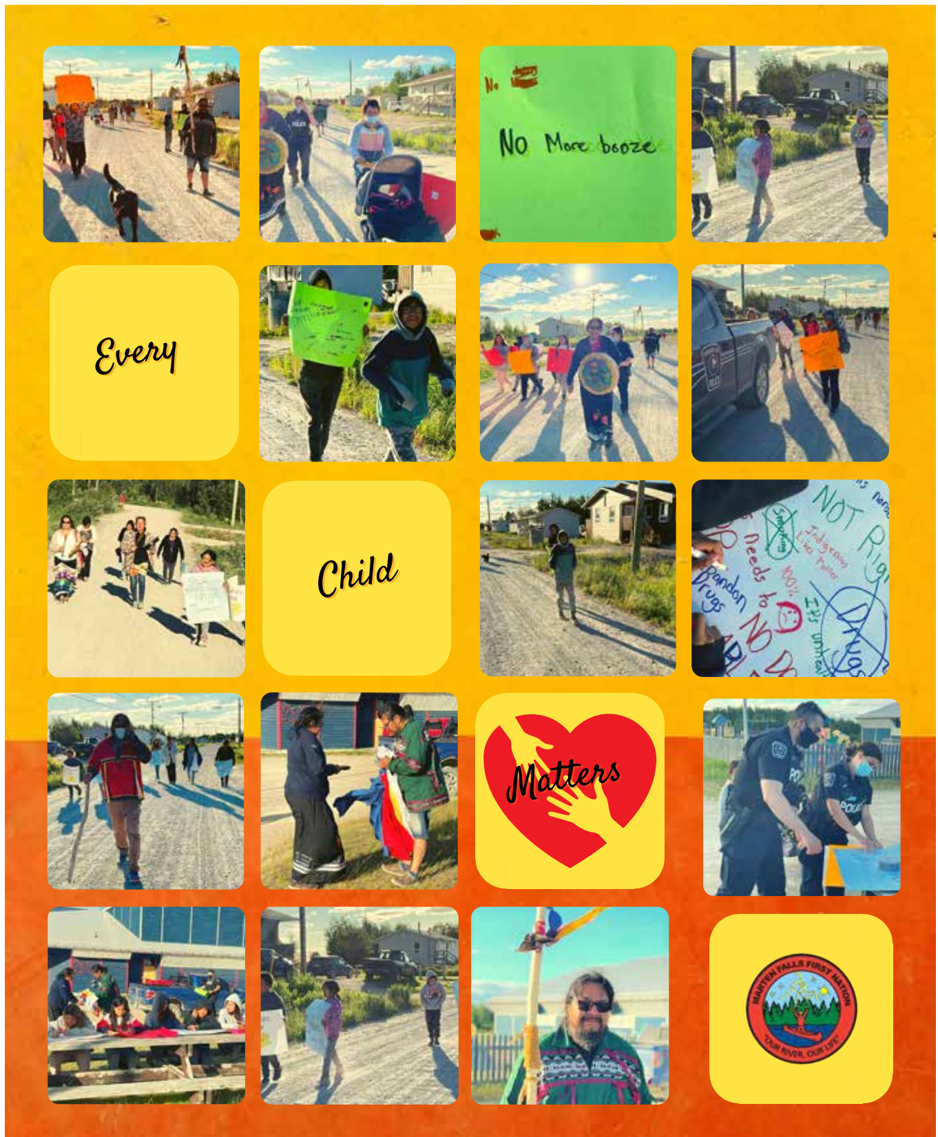
Pictured above on July 10, 2021: Marten Falls First Nation Community Healing Walk during Marten Falls First Nation Family Week 2021.